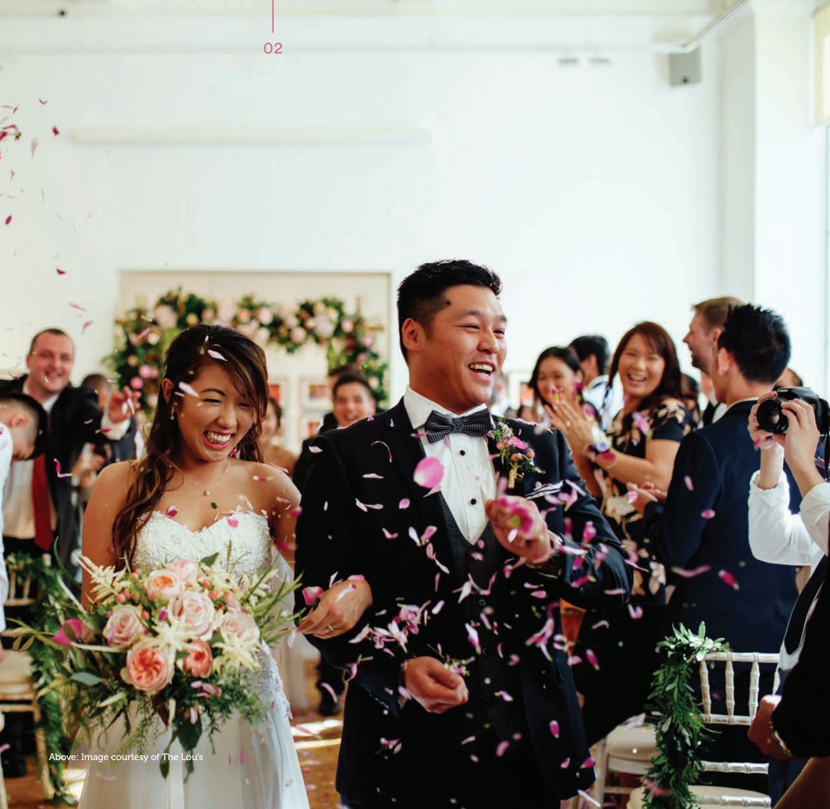
Above: Image courtesy of The Lou's