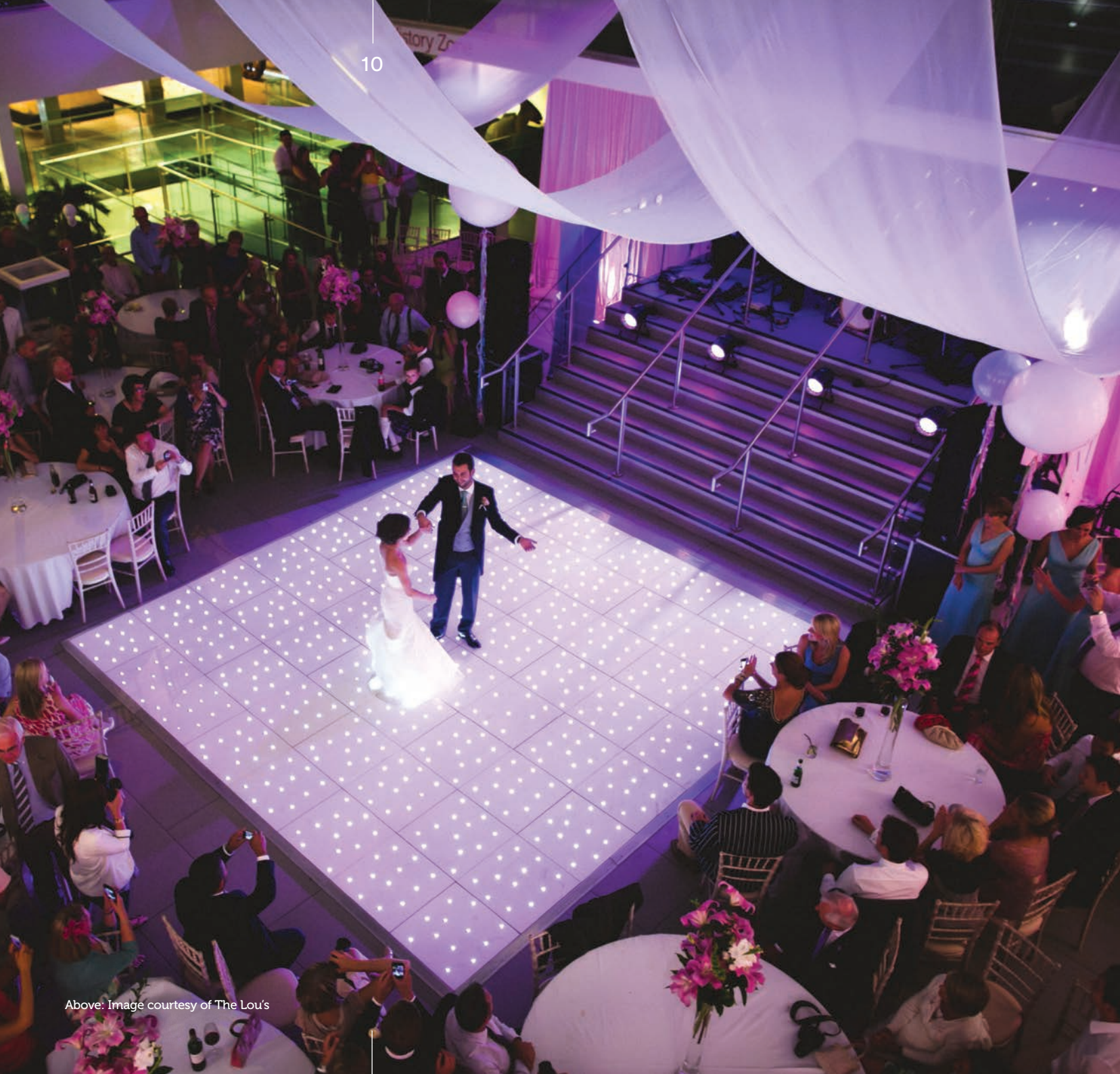
Above: Image courtesy of The Lou's