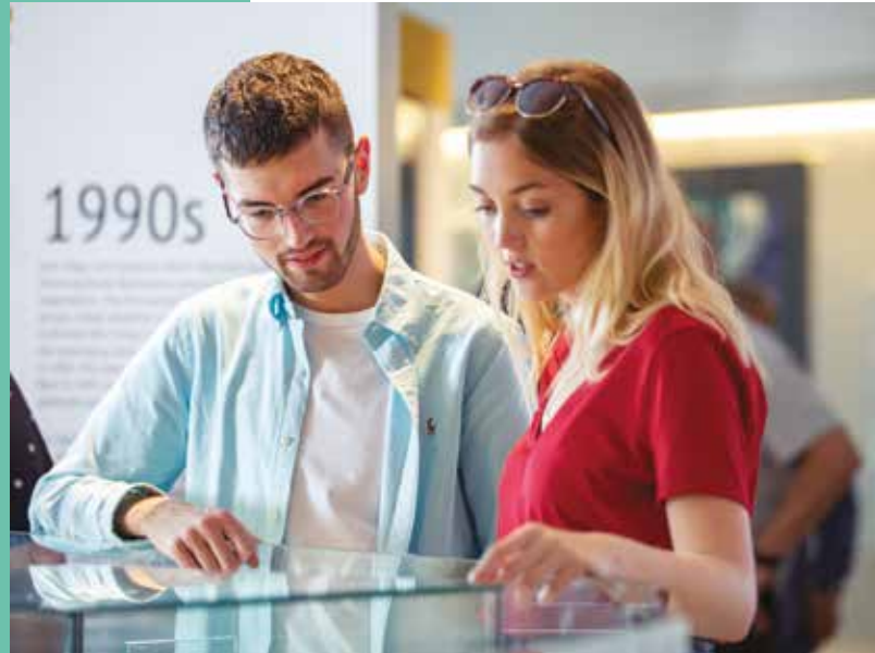
Above: Visitors engaging with The Troubles and Beyond exhibition

An independent evaluation was commissioned to assess the impact of our work on the Troubles and Beyond to date and to gather information and feedback to inform the development of future work. The evaluation has found that: