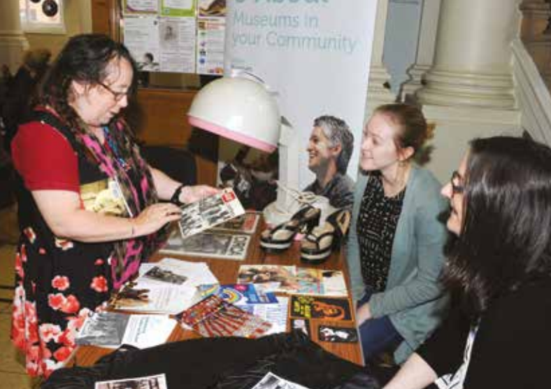
Above: Outreach event at Belfast Central Library on the theme of Alternative Ulster