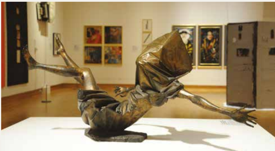
Left: Art of the Troubles exhibition, 2014, Ulster Museum. Woman in Bomb Blast , 1974/1 by F. E. McWilliam. Copyright of the FE McWilliam Estate