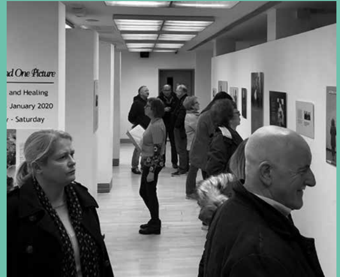
Above: Launch of the 200 Words and One Picture exhibition developed by Towards Understanding and Healing, Strule Arts Centre, Omagh

development, demonstrating the museum's increasing confidence in partnering with others including victims' groups, academic advisers, history teachers and community groups. Through the evaluation, stakeholders have expressed a keenness for these partnerships and community connections to continue and be extended to further partners in the future.