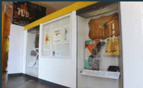
Above right: Gun games, the Art College

The Troubles and Beyond project has prompted greater clarity and coherence in National Museums NI's role with regard to the social peace process.