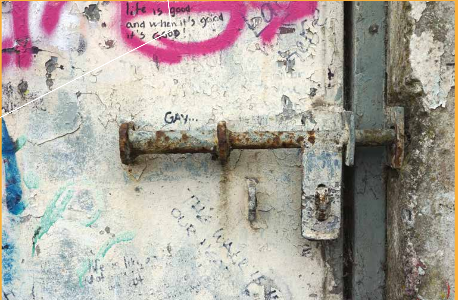
Above: Sealed door at Cupar Way.