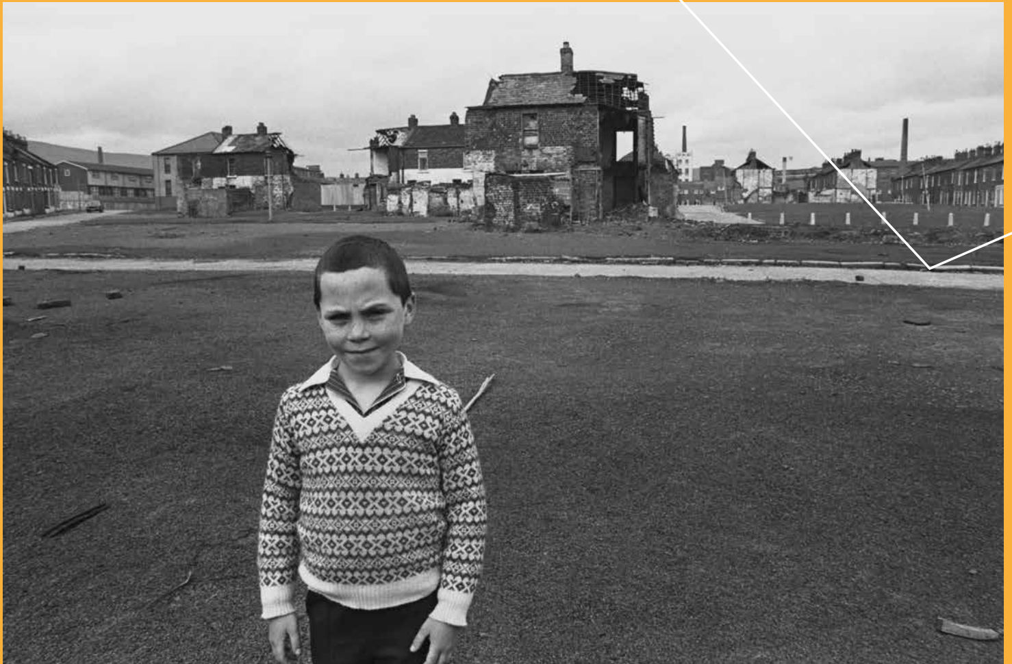
Above: Leeson Street during the redevelopment period, 1983.