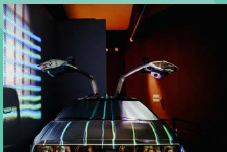
Journey Through Time