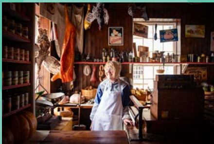
A Piece of History