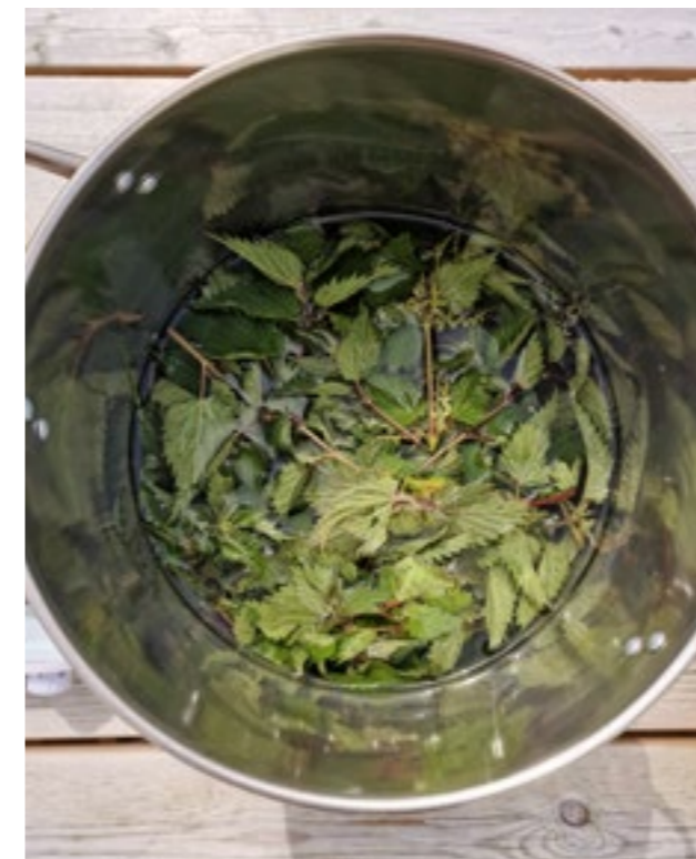
Nettles simmering in the dye pot